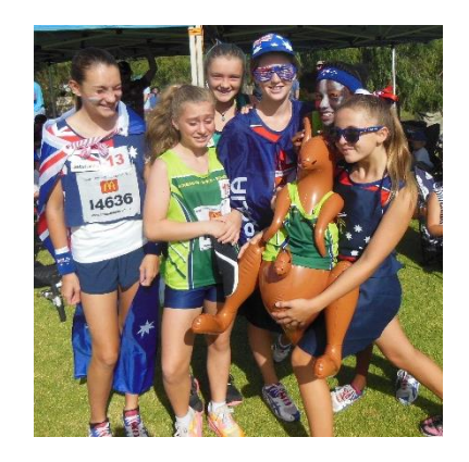
The Mindarie Mustangs are ready for fun!