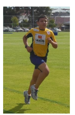
Well Done to all of the athletes that dressed up to compete!